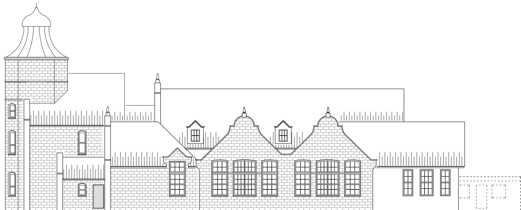
SIDE ELEVATION (B) (NO:01 MAIN BUILDING)